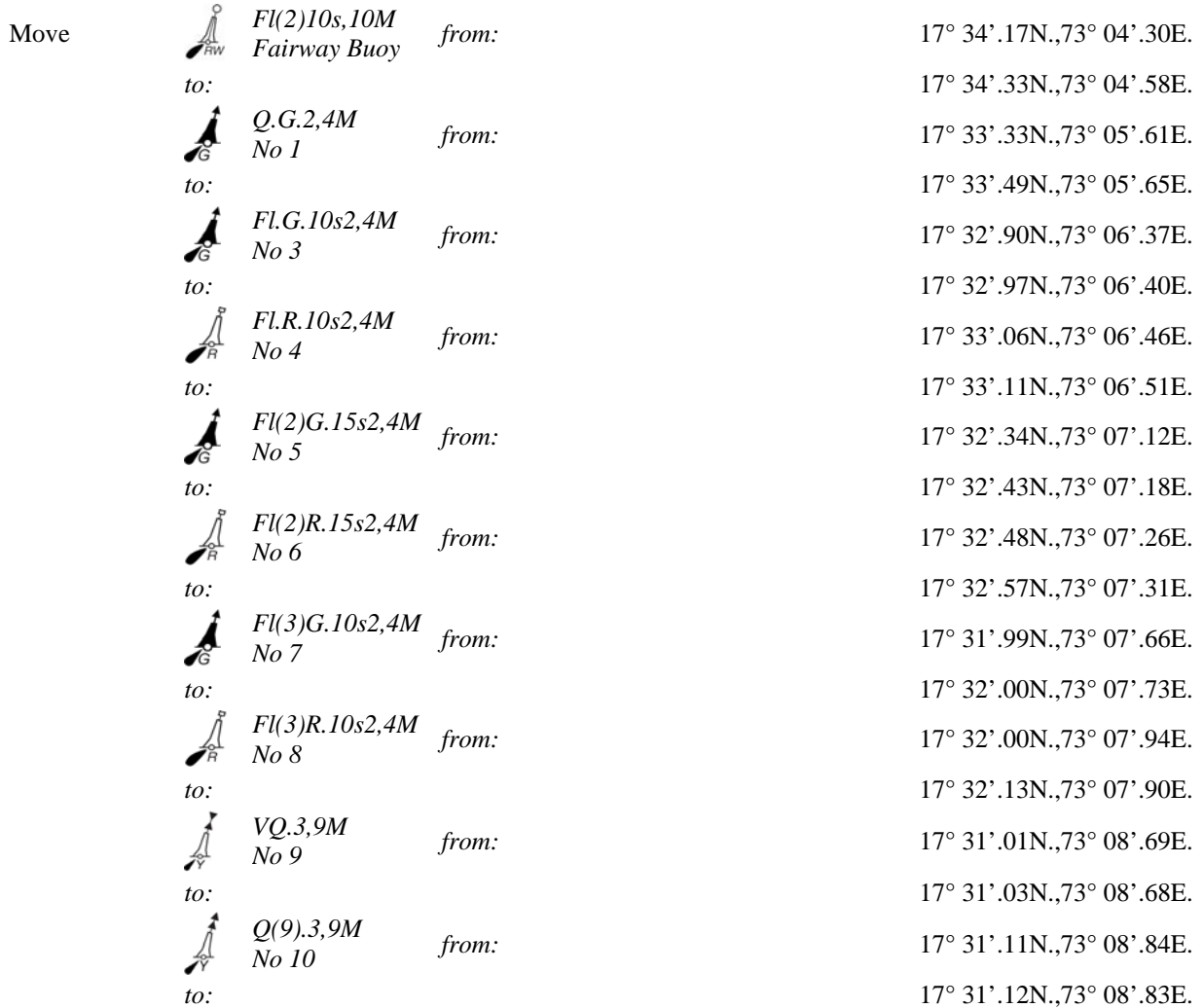
Chart 212 [previous update 229/11]